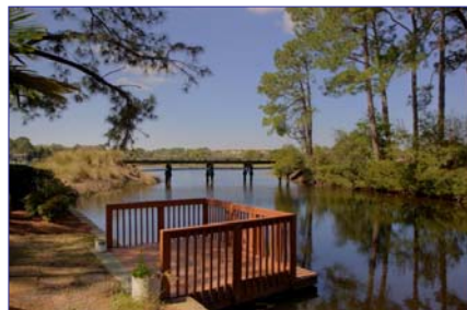
Private Fishing Dock