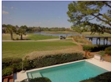
Pool, View of Lagoon & Golf