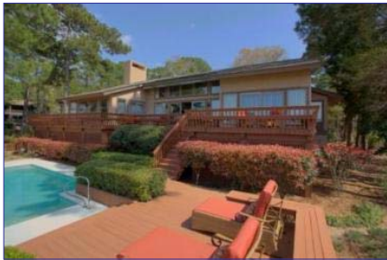
Pool, Large Decks & Back of Home