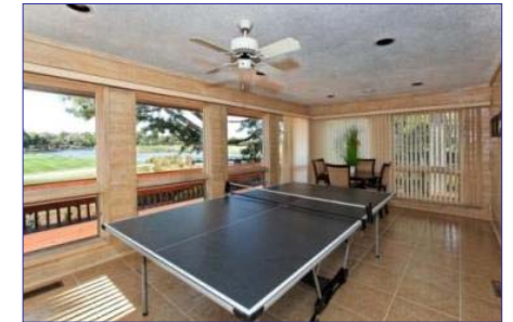
Game Room / Den