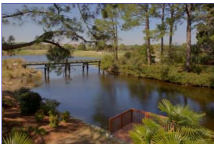
11 Mile Lagoon (View)