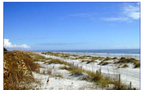
The Beach in Palmetto Dunes