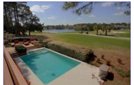
Pool, View of Lagoon & Golf