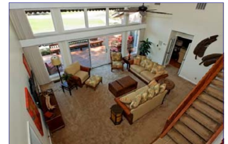
Living Room Overhead