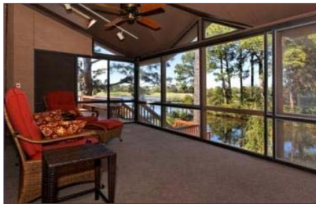
Carolina Room (Screened Porch)